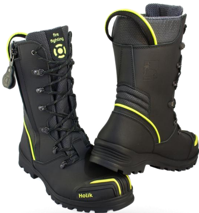
ZLIN TX Nomex Black